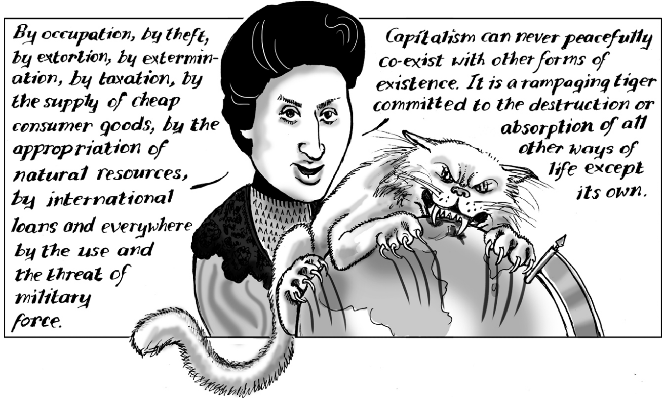
From Red Rosa: A Graphic Biography of Rosa Luxemburg , by Kate Evans

"Most of those bourgeois women who act like lionesses in the struggle against 'male prerogatives' would trot like docile lambs in the camp of conservative and clerical reaction if they had suffrage. Indeed, they would certainly be a good deal more reactionary than the male part of their class."